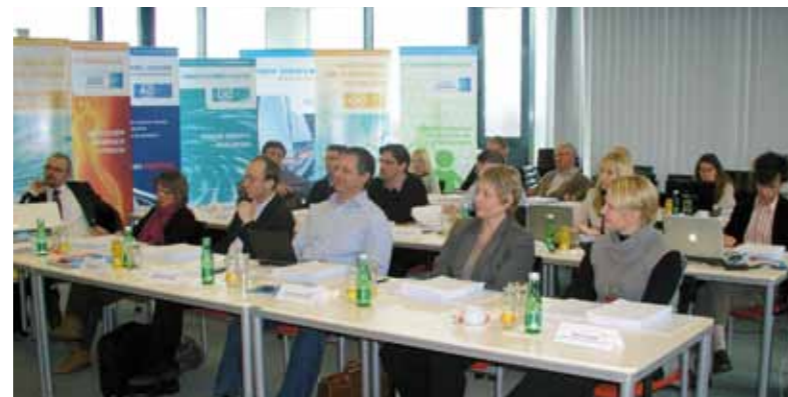
Class room participation, Cluster Academy 2011