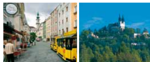
Impressions of the city Linz

Success factors of Clusterland were presented in the framework of the Upper Austrian business and political environment making it possible to put my own thinking on transferability into perspective. The Cluster Academy will be of great benefit to all cluster practitioners looking for a systematic approach of running a cluster management. Thanks to all of you at Clusterland for your enthusiasm and tremendous hospitality!"