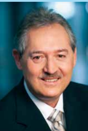
Viktor Sigl, Minister of Economy, Labour, Tourism, Sports and European Affairs, State Government of Upper Austria