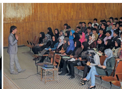
Left: The Dean of the Faculty of Public Administration and lecturer colleagues from the University of Jalalabad during a workshop in Kabul