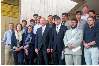
First summer academy 2012 in Ankara