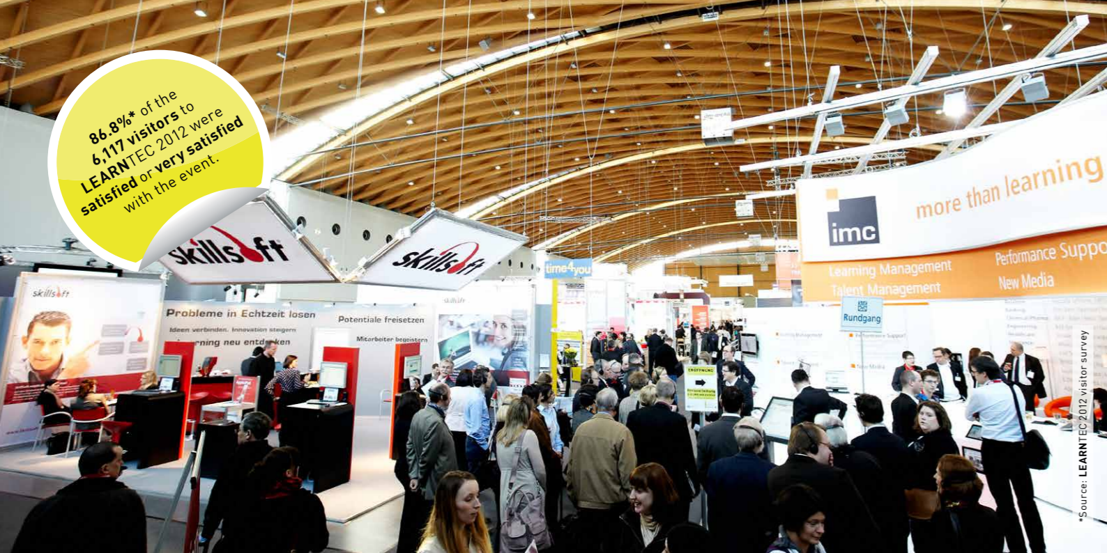
*Source: LEARNTEC 2012 visitor survey

86.8%* of the 6,117 visitors to LEARNTEC 2012 were satisfied or very satisfied with the event.